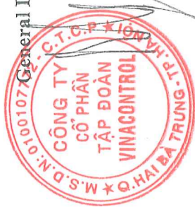
Mai Tien Dung